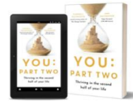
You: Part Two Hachette 2012/22

Speeches, workshops, webinars and interactive events that enable your leaders and your people to thrive in a world of change.