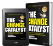
The Change Catalyst Wiley 2017

Author of 2018 Business Book of the Year