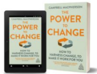
The Power to Change Kogan Page 2020